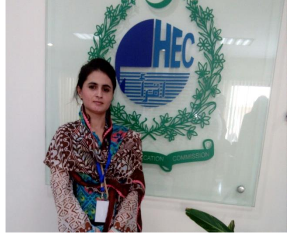
She completed her BBA with distinctive grades of 3.95 CGPA and also completed her MS Management successfully.