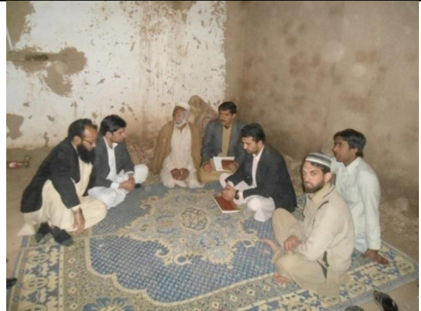
Hujra Village Lakarai Kaniza (Kandi Bala) Peshawar