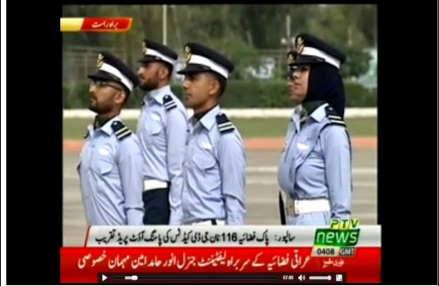
He is a son of a Taxi Driver. He successfully completed his MBA with distinctive grades under Fully Funded Need Based Scholarship. He also represented Pakistan and the Institute at U.S. as a Cultural Ambassador.