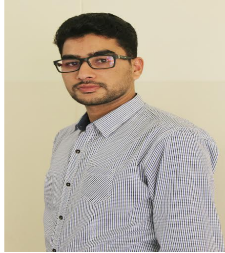
He topped his class with 4 CGPA and served Health Department Govt of KPK initially on Contract Basis.