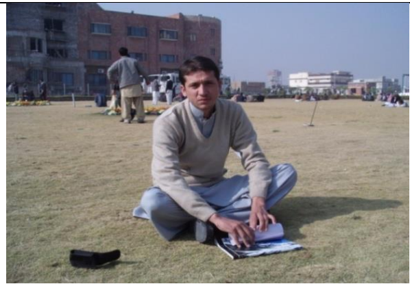
Availed fully funded scholarship under USAID Need Based Merit Scholarship Program Project