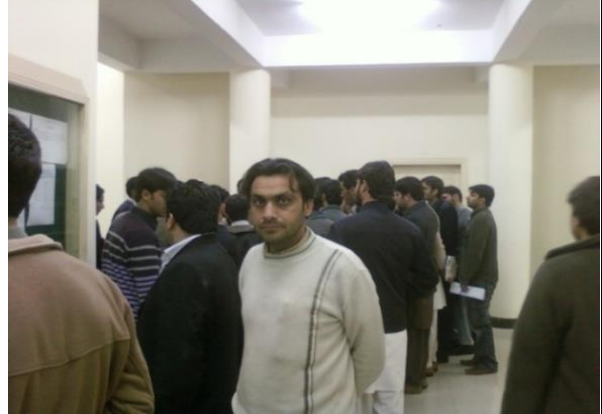
Availed fully funded scholarship under USAID Need Based Merit Scholarship Program Project