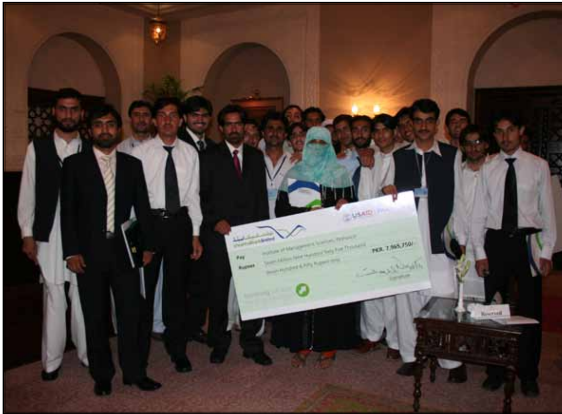
Students of IM|Sciences who recieved Khushhali Bank scholarships for FATA