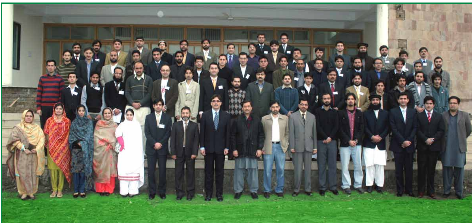
Graduates of Alumni Association (Session 2001-2006) with Director and Faculty Members of the Institute