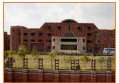
Stepping Stones of Success Journey of the Institute