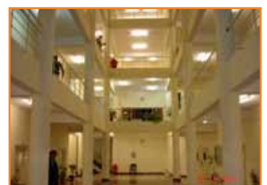
Internal & External Views of Academic Block, Boys Hostel and Girls Hostel