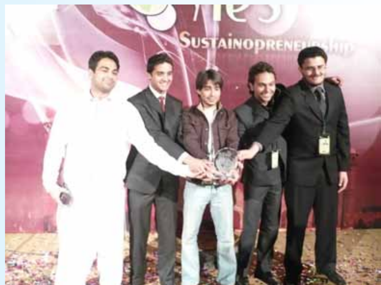
IM|Sciences' winning team members celebrating the success

ous categories of the LUMS Olympiad '09.