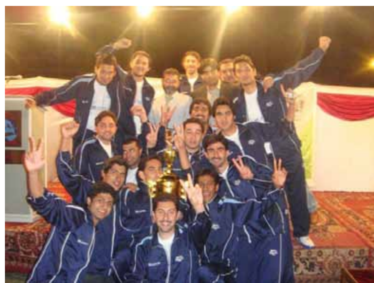
IM|Sciences' winning team of Football

first pool match on February 11 against FAST and defeated them by 8-1. The Institute faced Iqra University in the semi final on February 12, 2010 and won by 1-0. IM|Sciences had to face CECOS in final after they defeated Edwards by 1-0. The final was played