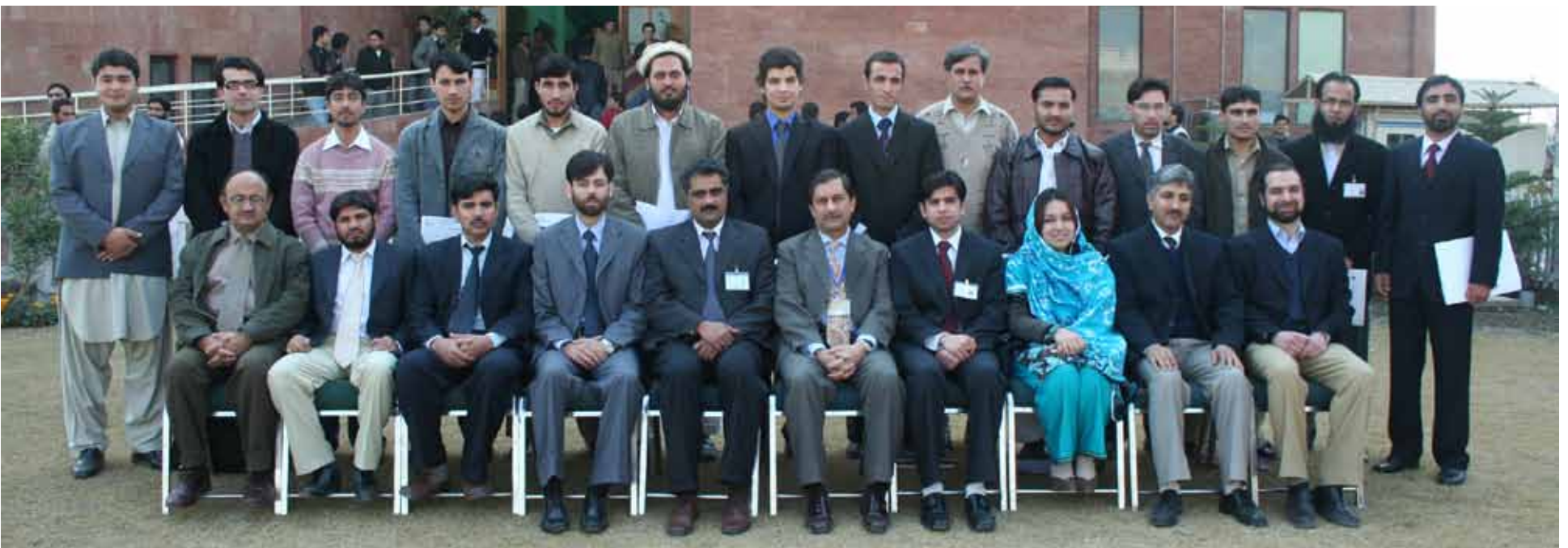
Scholarship Holders with the Chief Guest