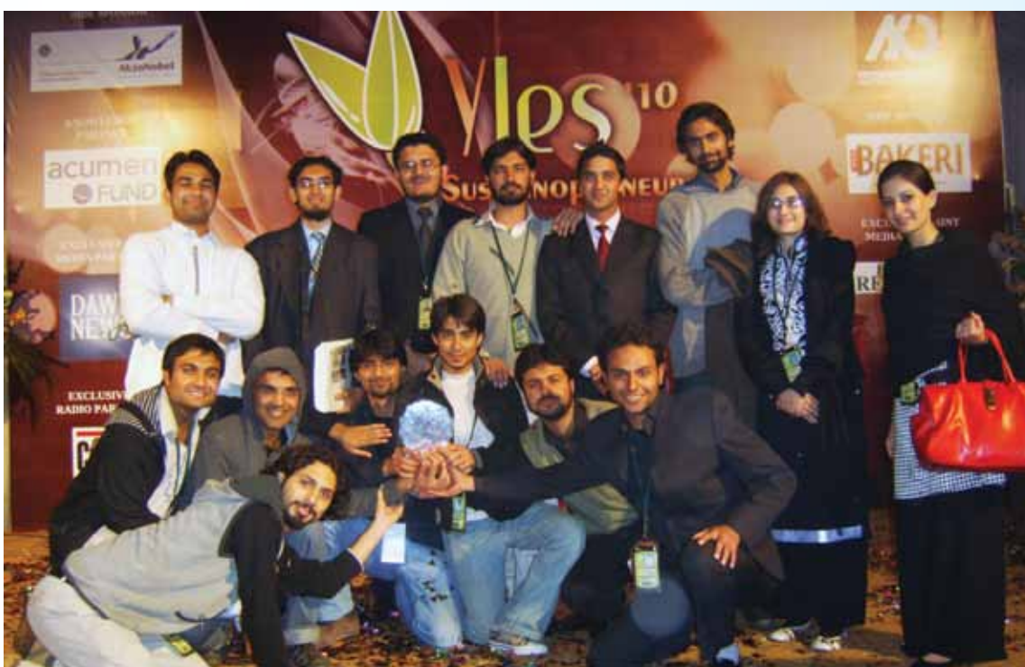
IM|Sciences' students receiving the Trophy

IM|Sciences faced a tough competition in the final round of BIC. Institute of Business Administration Karachi (IBA) and LGS (Lahore Defense) were the major contenders of the trophy in the final round. In this battle of marketable ideas IBA and LGS stood 2nd and 3rd respectively while IM|Sciences clearly stood out as the winners of the competition. It is a matter of great gratitude and pride that the Institute retained its performance of the previous year. Before the YLES' 10, IM|Sciences also secured 6-trophies in vari-