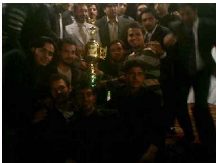
IM|Sciences' winning team of Cricket

In a landmark achievement, IM|Sciences won both cricket and football inter-universities tournament. The gala was arranged at Arbab Niaz Stadium and University of Peshawar by CECOS University in collaboration on with Anti-Narcotics Force. The theme of